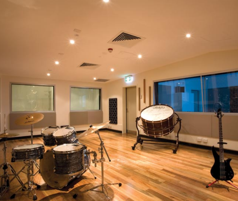
The Academy's theatre; right: one of the music studios