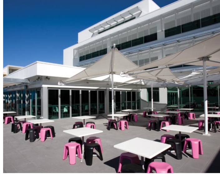
Creative spaces at QACI

intention of meeting the explicit programming needs of the staff and students, Laurence says few educational facilities are constructed with this ultimate goal as part of the overall vision.