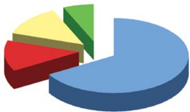
Fig. 1 What is your reaction so far as teachers to the system? Fantastic 13%; Very good 66%; Good 13%; OK 7%. (Rounded. Sample 15 teachers)