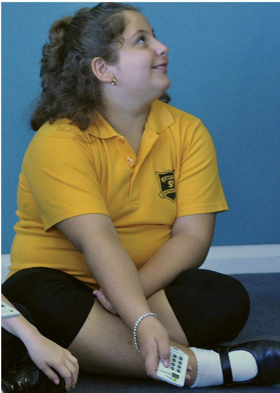
Primary students are keen users of Keypads

Despite the local community's disadvantages, Jamieson points, with justifiable pride, to the high school's commendable year on year improvements in both HSC and SC results. In 2009, 72 HSC students achieved Band 5 or 6, compared to 30 in the previous year. And the SC results were also the best ever: 94 in Band 5 and 6 compared to 47 in 2008.