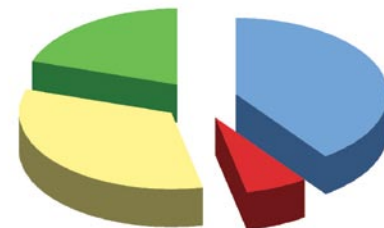
Fig. 3 How many keypad questions would you ask in a day? 9-10 40%; 7-8 7%; 5-6 33%; 3-4 20% (Rounded. Sample 15 teachers)

“very open to participating in pilots and trials. I’m all ‘open eyes’ to opportunities.”